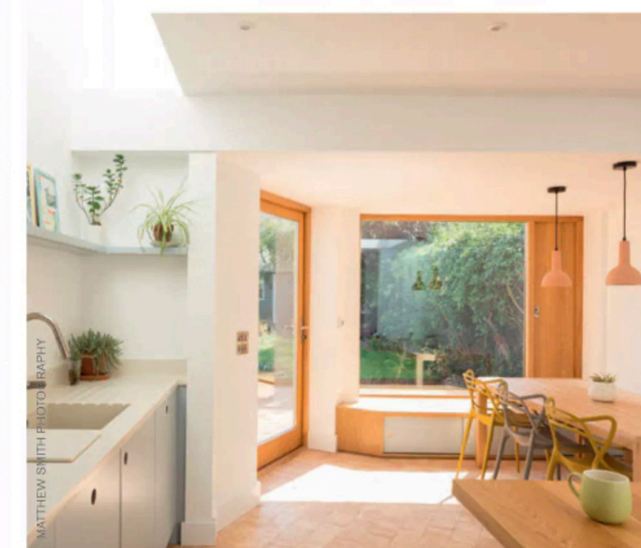
Above: This mid-terrace extension cost £110,000. BBA Architect’s design opened up a series of small rooms and formed a new open plan kitchen-diner with a window seat and garden views through oak frame glazing and doors

With the price of building materials rising due to shortages caused by the pandemic, Brexit and a surge in house