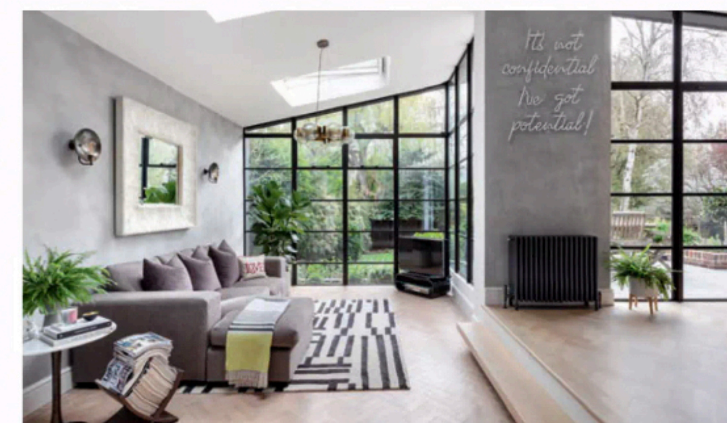
Above: Steps into a lounge in this London rear extension separate the relaxing area from the busy kitchen-diner. The corner window has a double aspect outlook and the pitched roof adds volume, plus rooflights. The 25m 2 project is by Granit Architecture + Interiors

If your architect or designer is local to your project, they are likely to have good contacts. The Federation of Master Builders has an online search tool ( www.fmb.org.uk ) or take a look at reviews on Checkatrade ( www.checkatrade.com ). In every case, make sure you've spoken to their customers and checked out their work to be sure they're a bona fide builder.