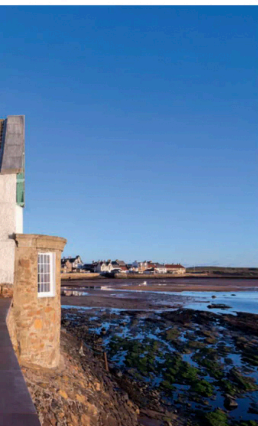
Left: A listed house on the coast in Fife was reinvented by WT Architecture on its seaward side, connected to the courtyard and panoramic views by a pair of highly-glazed frameless extensions up close to the sea wall. The addition creates around 40m 2 of extra space and the use of copper embraces natural sea weathering