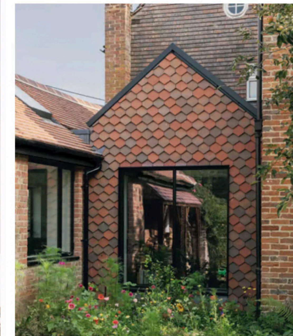
Below: This 50m 2 extension by Emil Eve Architects has created additional living space, plus a seamless connection between existing rooms and the outdoors. The project cost £208,000